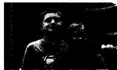
Campers meet new friends as well as old, year after year