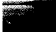
Waterfront area for activities