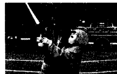
Rotary Clubs visit Campers & bring fun activities